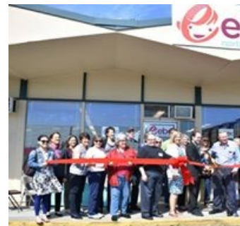
Grand Opening of EBC - Northshore Hub in Kenmore, May 2017