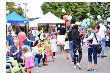
2017 Pants Party, sponsored by Springfree Trampoline

EBC is able to give the families of our community what they need, when they need it, because of the support of the community. From school children to retirees, houses of worship to local businesses, from corporations to Scouts, it takes hundreds of helping hands to ensure that EBC is fulfilling the promise of our mission. Thank you!