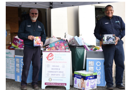
2017 Holiday Helper Drive...187 drives in 2017