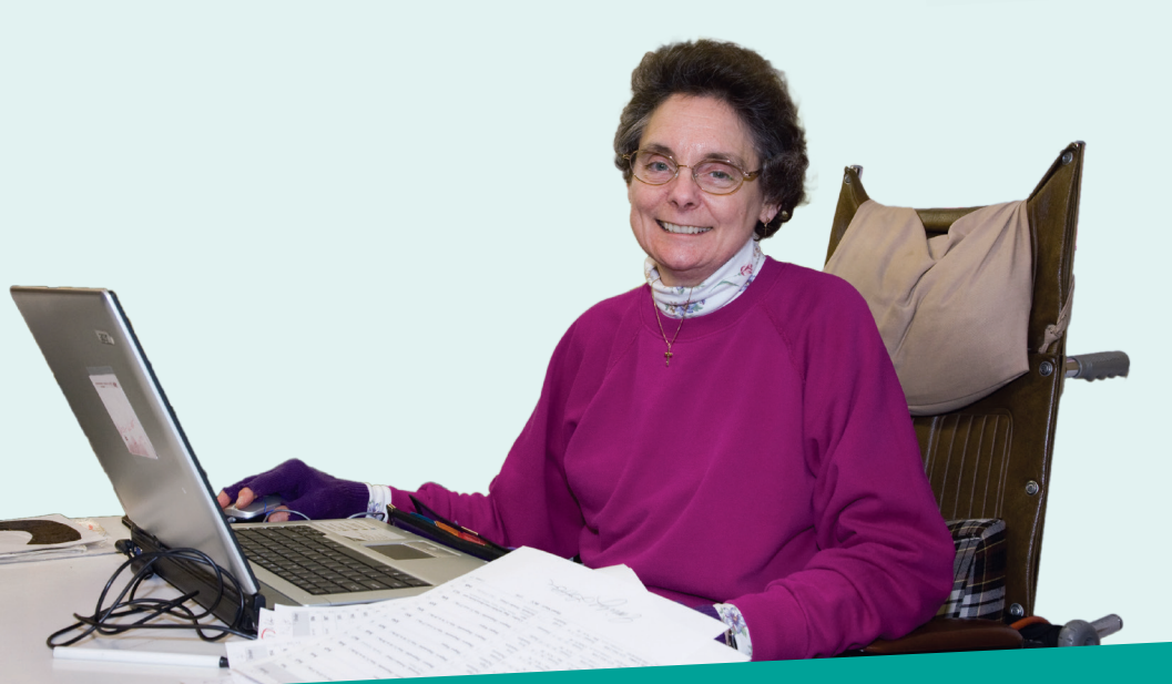
2023 Report to the Community