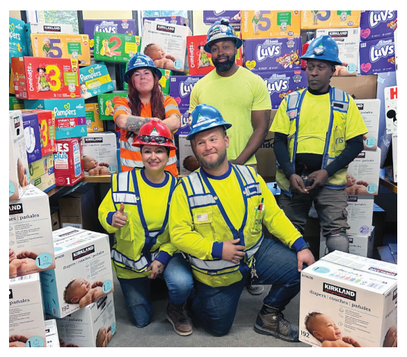
Kiewit-Hoffman employees with their Diaper Derby donations.