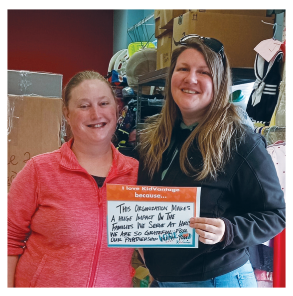
Providers from our Bremerton hub during "Share the Love" week.