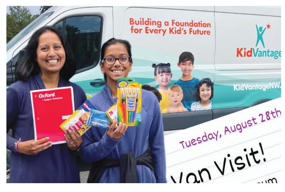
Our Pencils & Pants van visit to Bellevue.